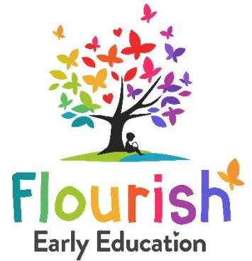
Flourish Early Education