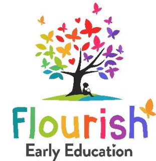
Flourish Early Education @ St. Peter's CE Primary School